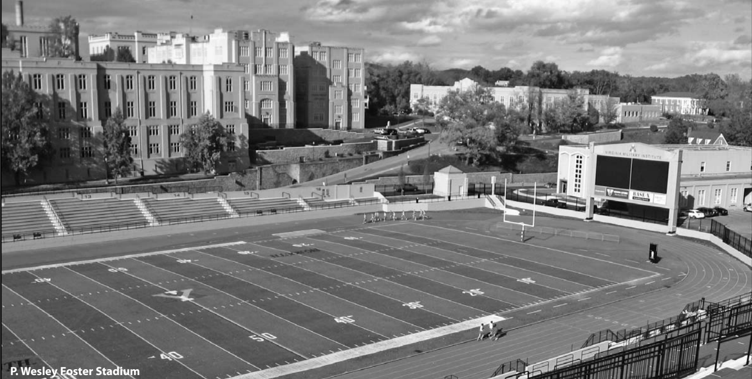
P. Wesley Foster Stadium